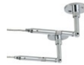
Kable Lite Universal Turnbuckles