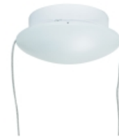
Kable Lite Surface Transformer-300W EL