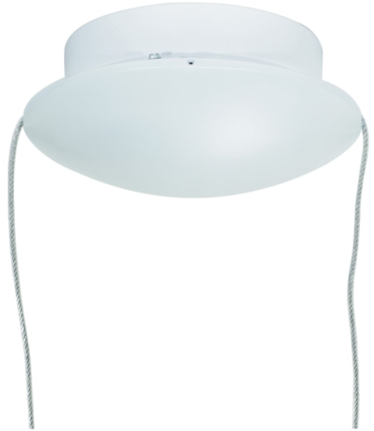
Kable Lite Surface Transformer-300W EL

It can power lamps totaling up to 300 watts. The transformer is concealed inside a decorative housing with a fast acting secondary circuit breaker that will safely turn the system off should a short occur. Once the short has been removed the unit can be reset by simply flipping the wall switch off and back on.