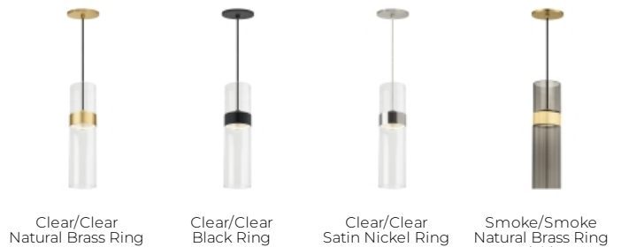
Clear/Clear Natural Brass Ring

Includes 8.5 watt, 464 delivered lumens. Dimmable with most LED compatible ELV and TRIAC dimmers. 277V dimmable with compatible 0-10V dimmers. Ships with twelve feet of field cuttable cable. Supplied with black cable