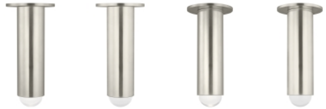
Antique Nickel (Lit) Antique Nickel (Unlit) Antique Nickel (Alt Lit) Antique Nickel (Alt Unlit)

Includes 120V-277V 10.5 watts, 620 delivered lumens, 90 CRI 2700K LED module. Dimmable with most LED compatible ELV, TRIAC and 0-10V dimmers. Ceiling mount only.