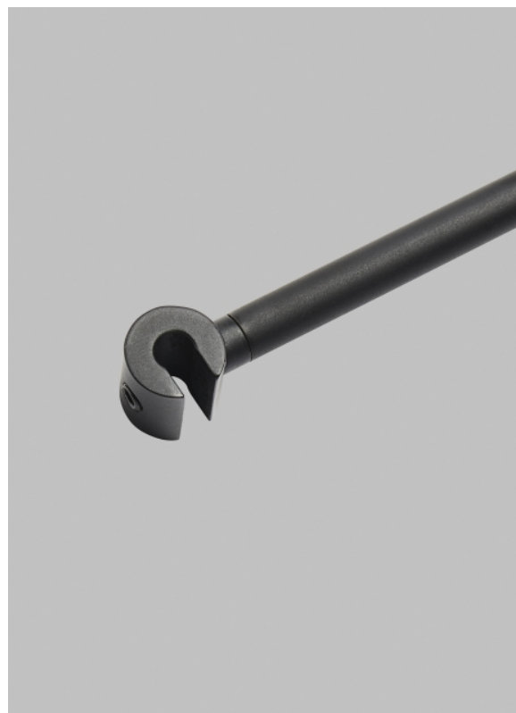
Hook Detail Black