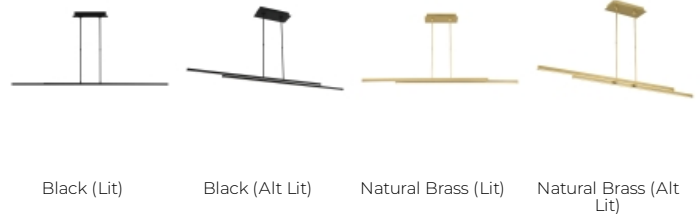
Natural Brass (Alt Lit)

Includes 55 watts, 5100 total delivered lumens, 2700K LED module. Dimmable with most LED compatible ELV, TRIAC and 0-10V dimmers. Ships with (8) 12" and (4) 6" rigid stems in coordinating finish. Can be installed on a sloped ceiling up to 15°. 120V-277V. Up and downlight.