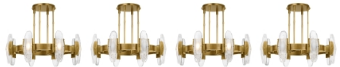
Plated Brass (Lit) Plated Brass (Unlit) Plated Brass (Lit) Plated Brass (Unlit)

To view all available finish options, please visit techlighting.com