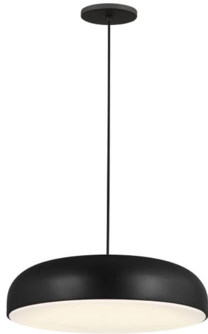
Nightshade Black Alt View

Includes 21.2 watts, 869 total delivered lumens, 3000K LED modules. Dimmable with most LED compatible ELV and TRIAC dimmers. Ships with 12 feet of field-cuttable black cloth cord. 120V-277V