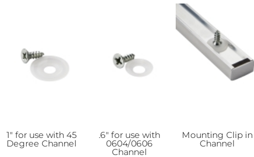
Mounting Clip in Channel