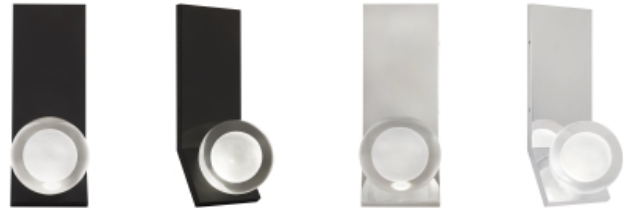
Nightshade Black Nightshade Black 3/4 Polished Nickel Polished Nickel 3/4

To view all available finish options, please visit techlighting.com