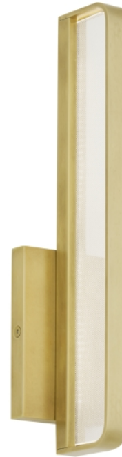
Natural Brass 3/4