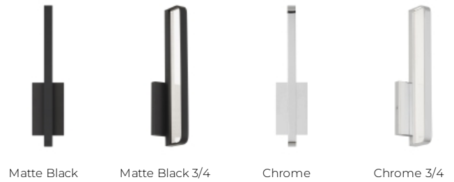
To view all available finish options, please visit techlighting.com

Includes 11.7 watt, 348 delivered lumens, 3000K 90 CRI LED module. 120V dimmable with most LED compatible ELV and TRIAC Dimmers. 277V compatible with 0-10V dimmers. ADA compliant. Mounts vertical or horizontal. 120V or 277V.