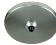
FreeJack Port With Canopy