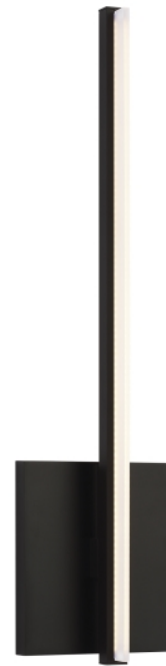
Matte Black Side View

120 volt 13 watt, 701 delivered lumens, 3000K LED module. Dimmable with most LED compatible ELV and TRIAC dimmers. 277V compatible with 0-10V dimmers. Mounts up or down