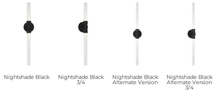
Nightshade Black 3/4

To view all available finish options, please visit techlighting.com