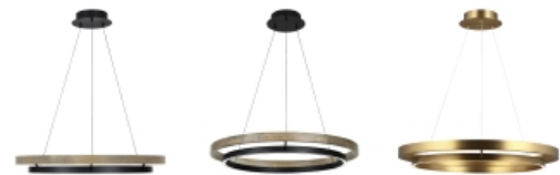
Matte Black / Weathered Oak Wood