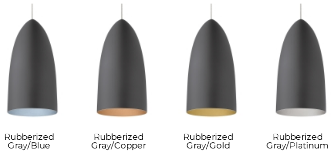
To view all available finish options, please visit techlighting.com

Rated for (1) 35w max, Halogen MR16 lamp or LED 6.5 485 delivered lumens, 90 CRI 3000K LED MR16 lamp and 6' of field-cutable suspension cable. For use with 24 volt transformer, add suffix '-24' to item number. (LED lamp option is not compatible with 24 volt transformers).