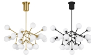
White/Aged Brass White/Matte Black

Includes (25) 2.6 watt, 65 delivered lumen (1675 total delivered lumens), 2700K LED modules. Fixture provided with 36 inches of variable rigid stems (includes (1) 12 inch & two 24 inch) in coordinating finish. Dimmable with most LED compatible ELV dimmers. Can be installed on a sloped ceiling up to 35°.