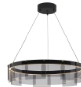
Smoke / Black 30"