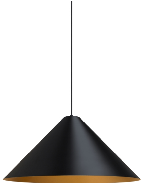
Black / Satin Gold

Rated for (1) 150 watt max E26 medium base lamp (Lamp Not Included) 120v 12 watt, 650 delivered lumen, 3000K, medium base LED G40 lamp. Fixture provided with twelve feet of field-cutttable cable. Dimmable with most LED compatible ELV and TRIAC dimmers.