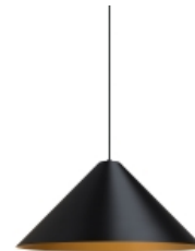
Black / Satin Gold