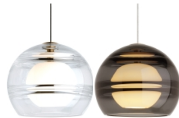
Clear / Aged Brass