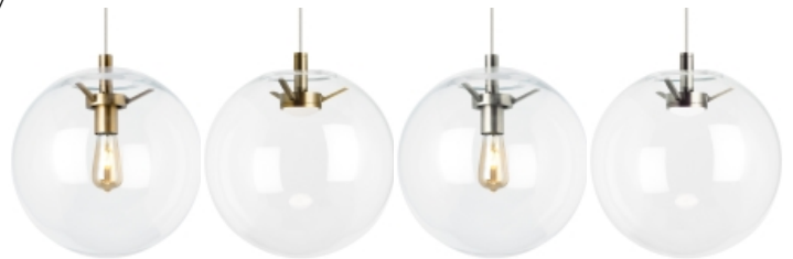
Clear / Aged Brass Incandescent