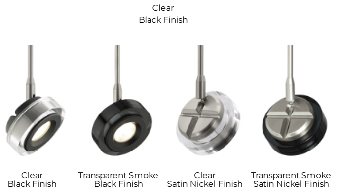
To view all available finish options, please visit techlighting.com

Includes 9.2 watt, 647.5 delivered lumens, 2700K or 3000K, 90 CRI field replaceable LED module Dimmable with most LED compatible ELV and Triac dimmers. Choice of 20°, 30° or 40° field changeable optics. Integrated lens holder accommodates up to 2 lenses or louvers (sold separately) As a general rule when using the Brim head, we do not recommend using greater than 33% of the maximum wattage specified for the low voltage transformer due to inrush current requirements. For assistance in calculations, please contact Technical Support.