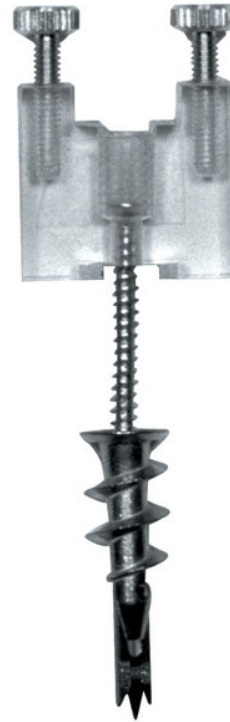
Wall MonoRail Standoff

Order one for every three feet of run and at corners.