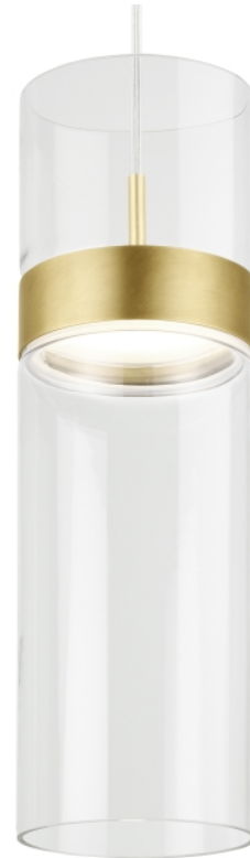
Clear/Clear Natural Brass Ring