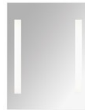
TL Reflection Mirror