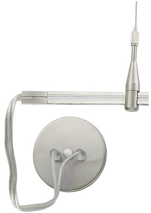
MonoRail End Power Feed

The end power feed pushes into an end of the MonoRail and includes a removable 4" round canopy and 12' of field-cuttable softwire leads.