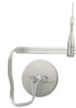
MonoRail End Power Feed