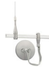
MonoRail Center Power Feed Single-Feed