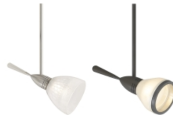
Satin Nickel With Soda Glass Shade Accessory