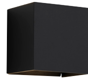
VEX shown in black