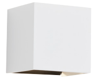
VEX shown in white

*Visit techlighting.com for specific warranty limitations and details. Ships with optional acrylic cover for protection against outdoor debris.