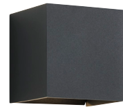
VEX shown in charcoal