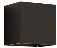
VEX shown in bronze