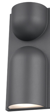
SAVINO 2 SMALL shown in charcoal