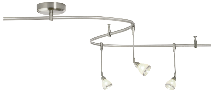
Satin Nickel shown with Tilt heads