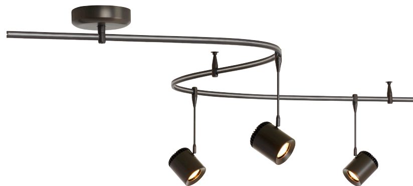
Antique Bronze shown with Burke heads