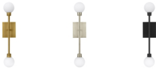
white/aged brass white/satin nickel white/matte black