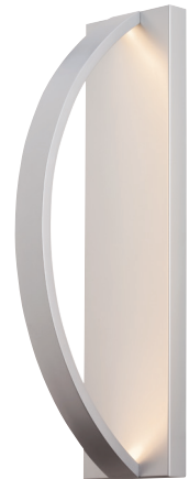
HUNTER 24 shown in silver