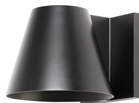
BOWMAN 6 Shown in Black