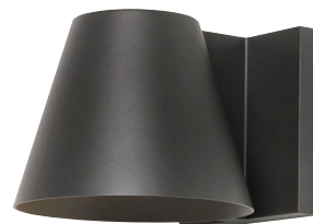
BOWMAN 6 Shown in Charcoal