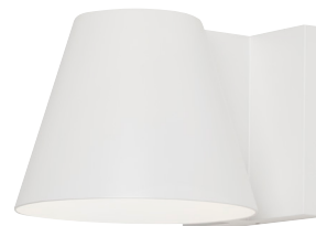
BOWMAN 6 Shown in White