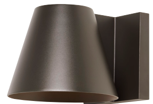
BOWMAN 6 Shown in Bronze