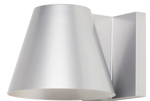
BOWMAN 6 Shown in Silver