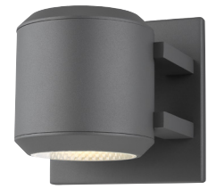
ASPENTI 5 shown in charcoal