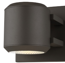
ASPENTI 5 shown in bronze

* Visit techlighting.com for specific warranty limitations and details.