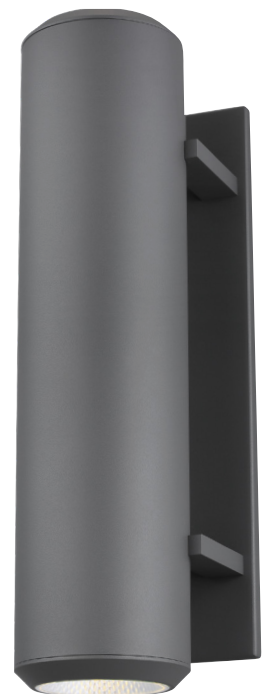
ASPENTI 20 shown in charcoal