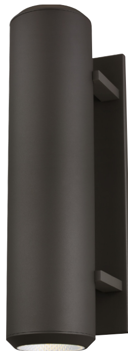
ASPENTI 20 shown in bronze

* Visit techlighting.com for specific warranty limitations and details.