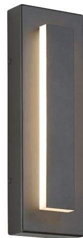
ASPEN 15 shown in charcoal

* Visit techlighting.com for specific warranty limitations and details.