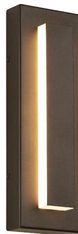
ASPEN 15 shown in bronze