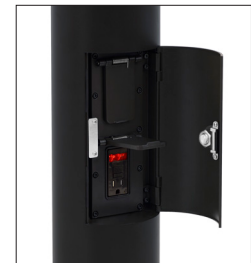
Shown with optional GFCI outlets