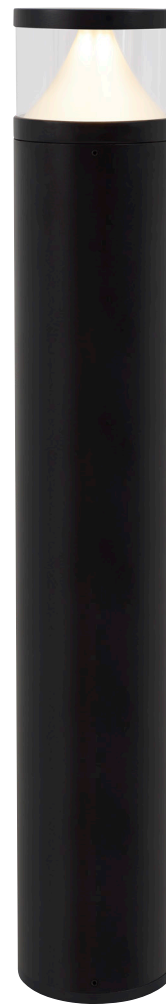
ARKAY THREE BOLLARD shown in black