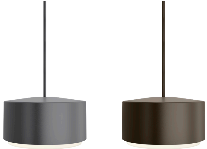
ROTON 18 PENDANT shown in charcoal

RIGID STEM ONLY (ADJUSTABLE 3", 6" AND 12" LENGTHS)