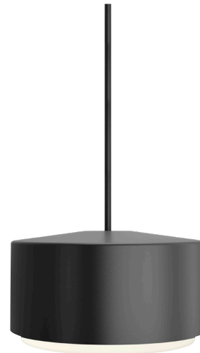
ROTON 18 PENDANT shown in black