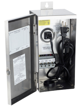
MAGNETIC TRANSFORMER shown in stainless steel