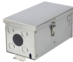
MAGNETIC TRANSFORMER shown in stainless steel

* Visit techlighting.com for specific warranty limitations and details. As a general rule when using LED fixtures, we do not recommend using greater than 70% of specified maximum wattage on the transformer due to inrush current. For assistance, please contact our technical support department.