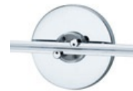
Wall MonoRail 4" Round Direct Canopy Single-Feed With LED Transformer