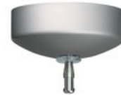
MonoRail Surface Transformer-60W EL LED