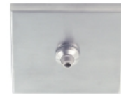
FreeJack 4" Square Flush Canopy LED