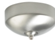
FreeJack Surface Canopy LED