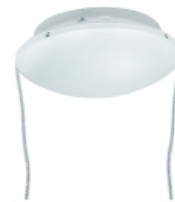
Kable Lite Surface Transformer-150W EI