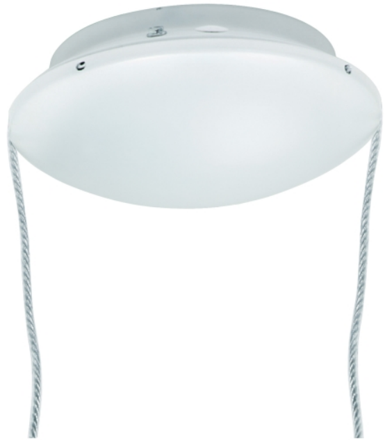
Kable Lite Surface Transformer-150W EI

It can power lamps totaling up to 150 watts. The transformer is concealed inside a decorative housing with a fast acting secondary circuit breaker that will safely turn the system off should a short occur. Once the short has been removed the unit can be reset by simply flipping the wall switch off and back on.