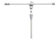
Kable Lite FreeJack Connector