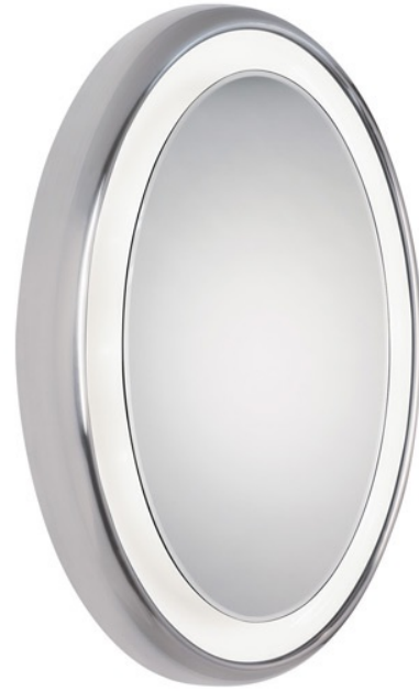
Tigris Mirror Oval