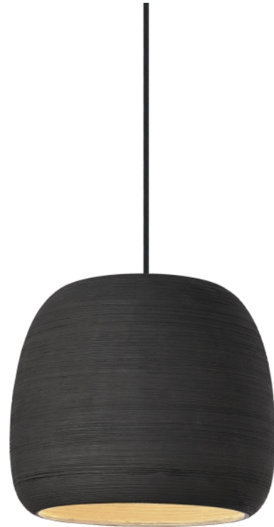
Black / Black Small

Rated for (1) 100 watt max. E26 medium based lamp (Lamp Not Included). LED includes 19 watt, 1680 gross lumen A21 LED lamp. Provided with six field-cuttable cloth cord to match finish selection. Dimmable with most LED compatible ELV and TRIAC dimmers.