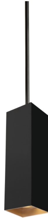
Matte Black / Gold Haze 18"