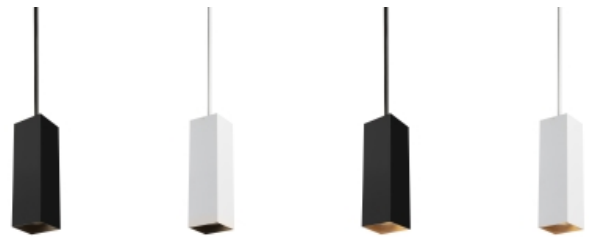
Matte Black / Black 18"

Includes 120-277 universal voltage 14 watt, 1047 delivered lumens, 2700K, 3000K or 3500K LED modules. Choice of 20°, 30°, 40° or 60° field changeable optics. Dimmable with most LED compatible ELV, TRIAC and 0-10V dimmers.