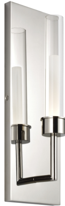
Polished Nickel Side View